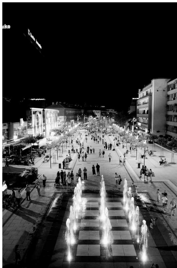
Mother Teresa Boulevard, Prishtina's Main Street

The real estate market in Kosovo is experiencing growth, driven by urbanization, increased foreign direct investment (FDI) and a growing diaspora that is investing in property. The construction sector is also booming, with numerous infrastructure projects underway, including roads, bridges and housing complexes. Japanese investors can explore opportunities in residential, commercial and industrial real estate, as well as public infrastructure construction.